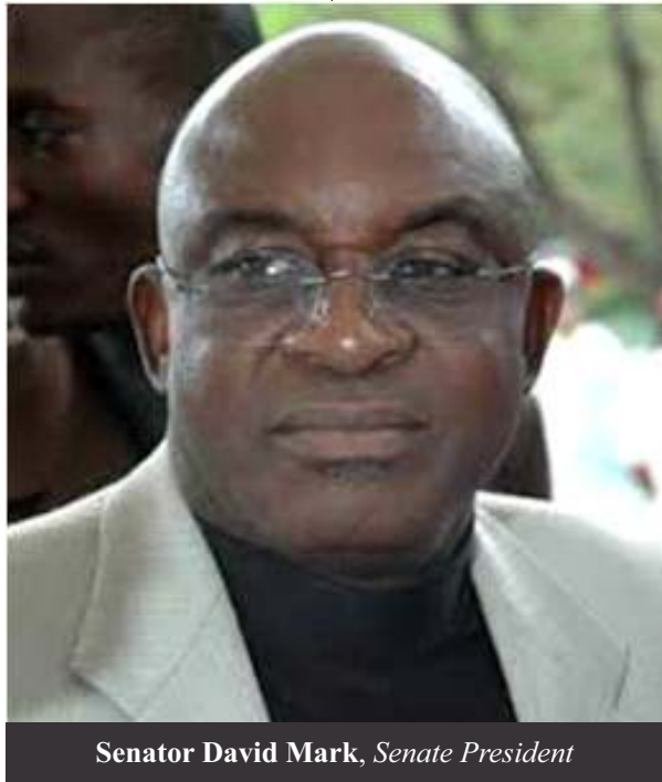
Senator David Mark, Senate President