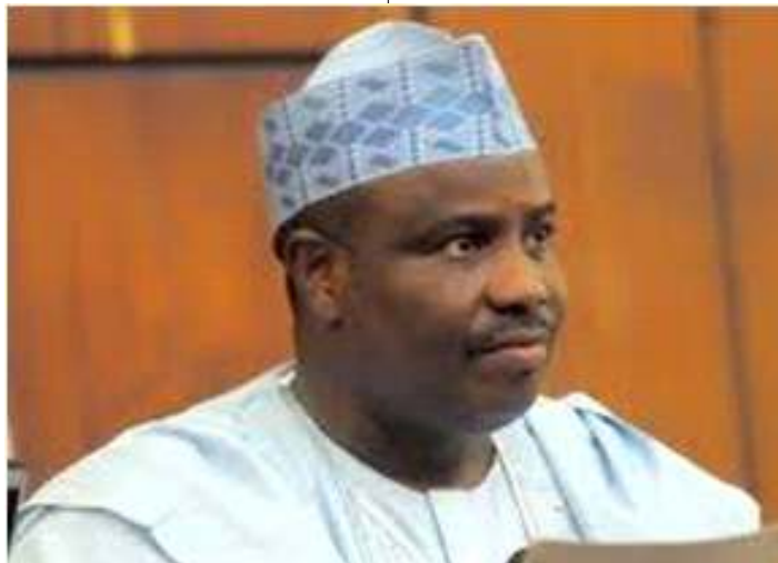
Hon. Aminu Bello Tambuwal, Speaker, House of Representatives

the law does not specifically provide for the mode of commencement of action under the Freedom of Information Act, supra, we submit that the action for judicial review are usually commence(sic) by way of originating motion, which is a conventional mode of commencement of action in our courts.”