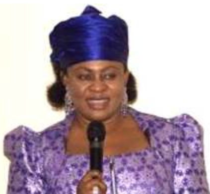
Stella Oduah, Former Minister of Aviation

Objection argued that MRA and PPDC will be subjecting their statutory and constitutional rights to the discretion of the Court if they issue the NCAA with a pre-action notice, because the 30 days provided by the FOI Act, 2011 for an applicant to approach the Court for Judicial Review would have elapsed at the expiration of the pre-action notice. NCAA in its reply on Points of Law argued that MRA and PPDC ought to have given NCAA the Pre-action notice since the Court can still enlarge the time.