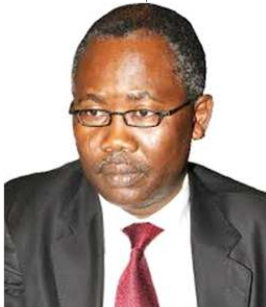
Mohammed Bello Adokie, Attorney General of the Federation

The deponent stated that on receipt of the Applicant's letter of request, he had promptly replied and informed