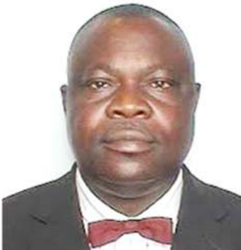
Justice Chima Centus Nweze

“ The challenges of hierarchy and bureaucracy in the public service and its implications for vesting