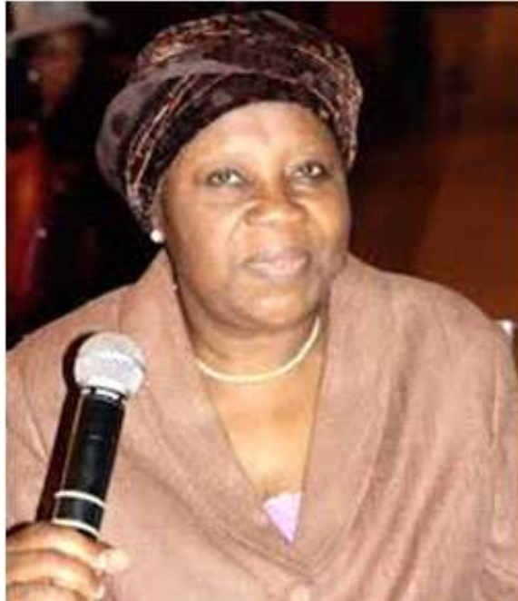
Justice Aloma Mariam Muktar, Chief Justice of Nigeria

questions regarding the alteration of the 1999 Constitution of Nigeria by the Defendants under Sections 9 and 58 of the same Constitution. Upon the determination of the three questions, the plaintiff sought for five declarations on the legality of the constitutional alteration by the 1 st to 4 th Defendants without the assent of the President.