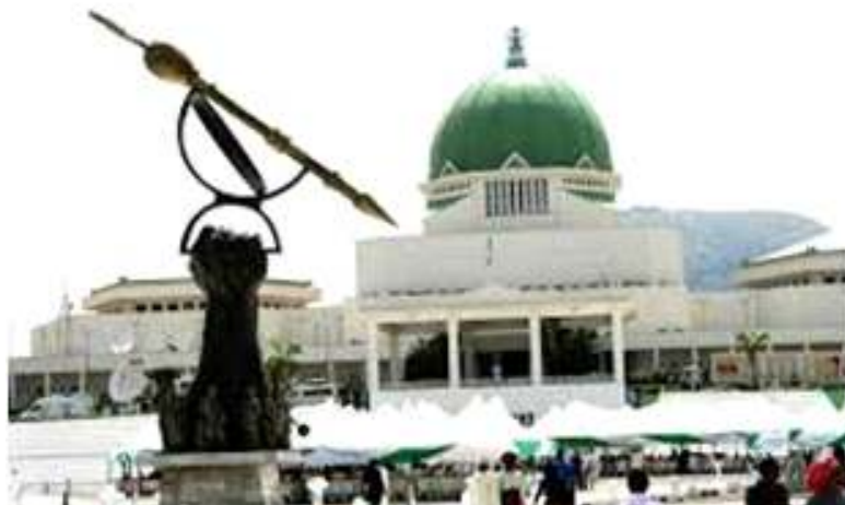
National Assembly Complex, Abuja

Observing that the Respondent relied on two grounds for denying the applicant access to the information requested, the first ground being that the two cases are pending in respect of these records, and it will be " prejudicial " to these cases if the Applicant's request is granted, Justice Aliyu asked: "what interest of the Respondent will be prejudiced by the release of the