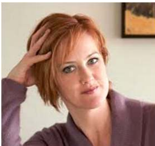
Heather Brooke, A journalist and avid user of the FOI Act in the United Kingdom

The appeal was heard at the High Court, which ruled on May 16, 2008 in favour of releasing the information.